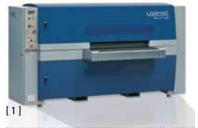
[ 1 ]