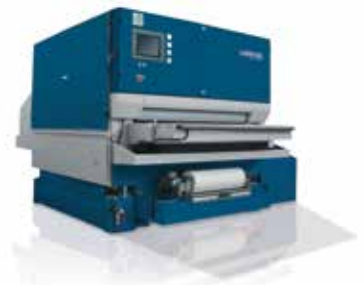
[ 1 ]