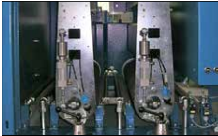
Configuration with 2 tool sets (e.g. RT)