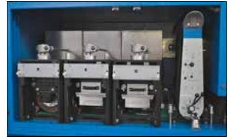
Configuration with 4 tool sets (e. g. RTTB)

LISSMAC Grinding Machines of the SMW 5 series set benchmarks for perfect surface finish using the wet grinding process. The SMW 5 is built according to the modular principle and can be individually configured to meet customer requirements and is characterised by low tool costs, simple handling and also by the cost effective price-performance ratio which results in short amortisation times.