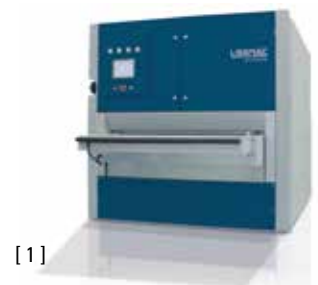
[ 1 ]