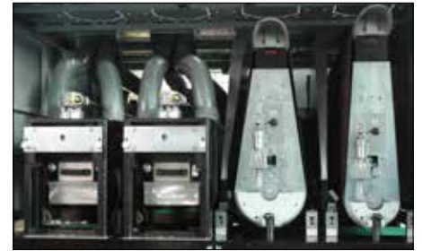
Configuration with 4 tool sets (e.g. RRTT)

LISSMAC Grinding Machines of the SMD 5 series set benchmarks for perfect surface finish using the dry grinding process. The SMD5 is built according to the modular principle and can be individually configured to meet customer requirements and is characterised by low tool costs, simple handling and also by the cost effective price-performance ratio which results in short amortisation times.