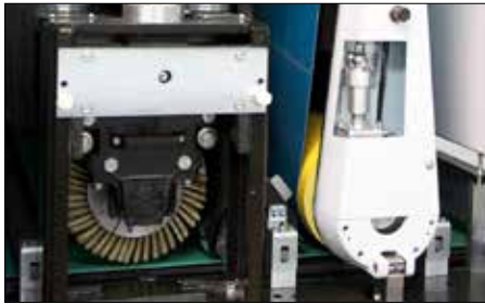
Configuration with 2 tool sets (e.g. RT)