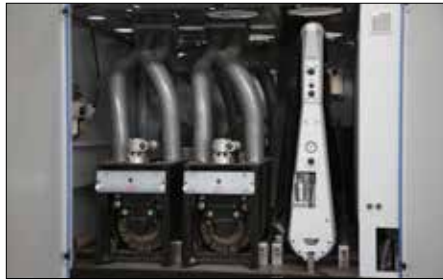
Configuration with 3 tool sets (e.g. RBB)